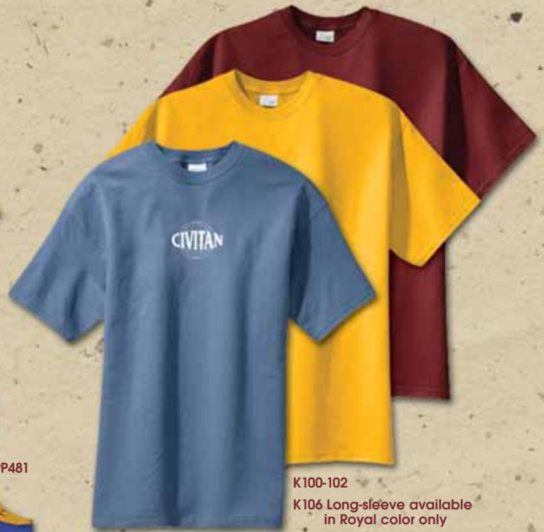
K100-102 K106 Long-sleeve available in Royal color only