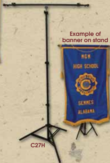
Example of banner on stand