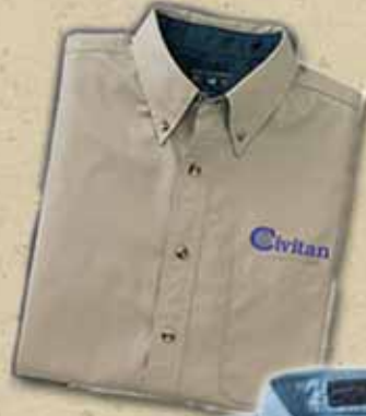
CV343 Men's CV345 Women's