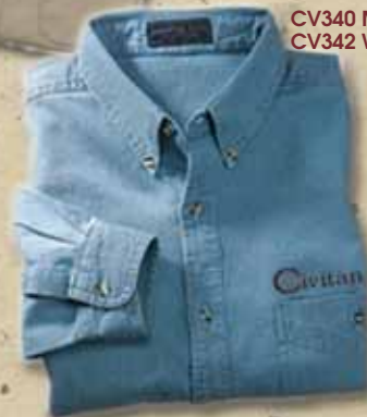
CV340 Men's CV342 Women's