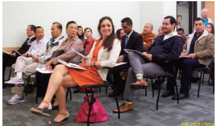
Group of soon-to-be U. S. Citizens