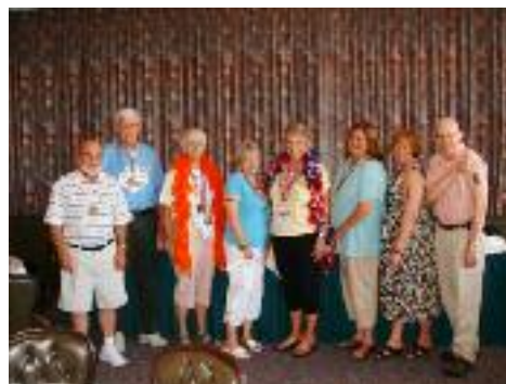
Topeka Civitan's display their New Orleans memorabilia. Are the Tattoos Real?