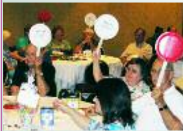
Friday night's Paddle Party raised over $1,100 for Civitan International Research Center